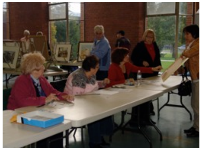
Jurying In Process at Donway Covenant Church

December 14, 2011 Annual party to celebrate the season. Details to follow.